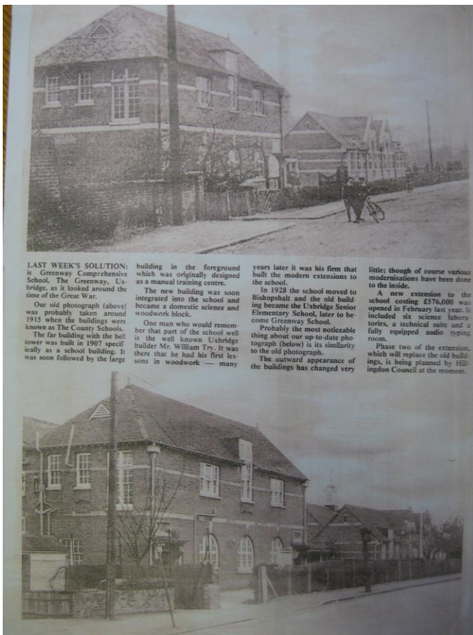
Greenway County School in 1915

Bishopshalt Grammar School developed from the Uxbridge County School which occupied premises in the Greenway from 1907. This building was vacated in 1928 when the school was transferred to the house in Royal Lane which had been built on the site of the old rectory house owned by the Bishops of Worcester. The school then adopted the name Bishopshalt and was constituted a grammar school. The Greenway premises were subsequently occupied by the Greenway County Secondary School. A second grammar school, Vyners Grammar School, Warren Road, just inside the northern boundary of Hillingdon old parish, was opened in 1960.